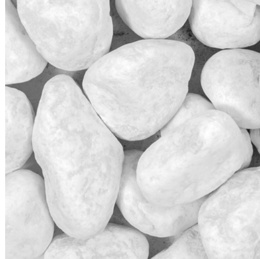
LARGE 2" - 3"