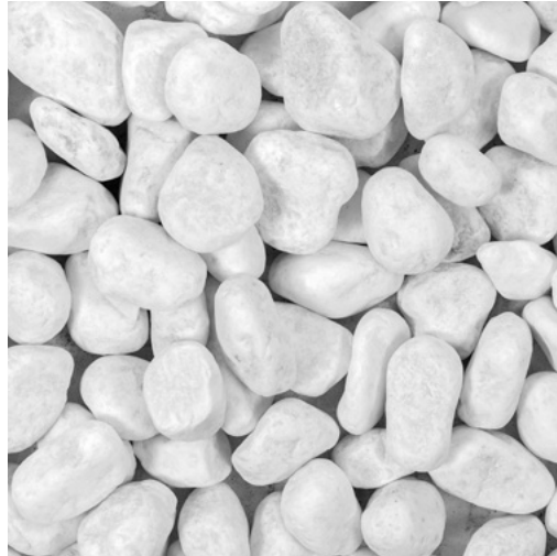
MEDIUM 1/2" - 1 1/2"