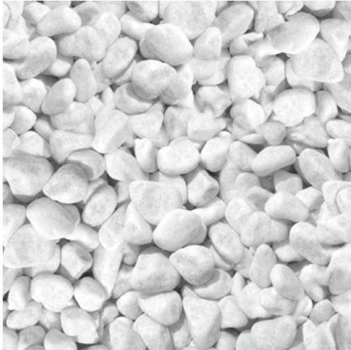
SMALL 3/8" - 5/8"