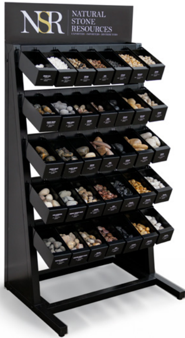
LOOSE PEBBLE DISPLAY