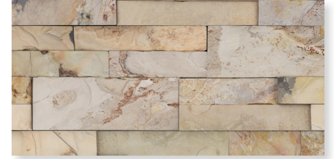
INDIAN AUTUMN NATURAL