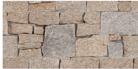
TIGERSKIN YELLOW NATURAL