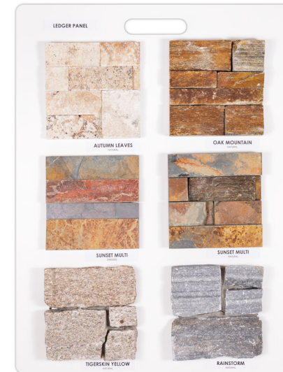
LIBRARY BOARD LBLP35