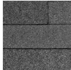
ABSOLUTE BLACK FLAMED 6X6 SAMPLE