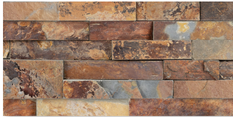
SUNSET MULTI COLOR NATURAL