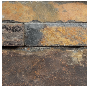
SUNSET MULTI COLOR NATURAL 6X6 SAMPLE