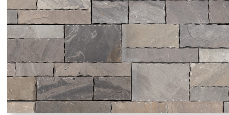
TAVERN GREY NATURAL