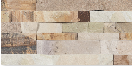
NEW HONEY WHEAT NATURAL