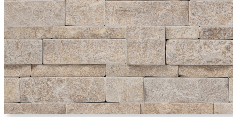
SANDY BEACH SPLITFACE/ ANTIQUE