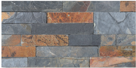
SUNSET MULTI COLOR DRESSED