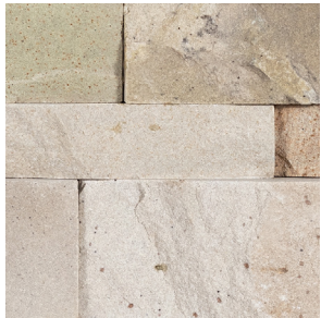
NEW HONEY WHEAT NATURAL 6X6 SAMPLE