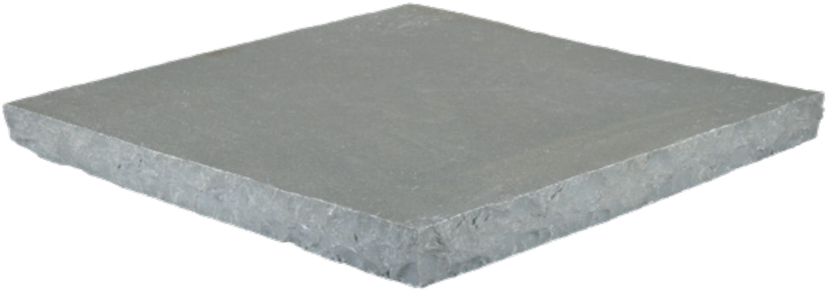
24 X 24 X 5CM INDIAN BLUESTONE GAUGED SLATE • ROCKFACE EDGE COLUMN CAP SOLD BY PC