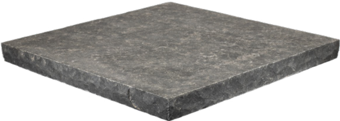
24 X 24 X 5CM OLYMPUS BLACK FLAMED BASALT • ROCKFACE EDGE COLUMN CAP SOLD BY PC