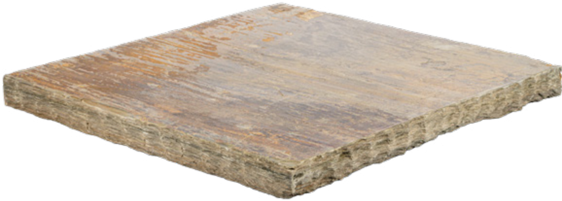
24 X 24 X 5CM CALIFORNIA GOLD GAUGED SLATE • ROCKFACE EDGE COLUMN CAP SOLD BY PC